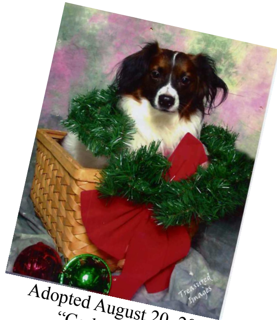
Adopted August 20, 2007 "Cody"